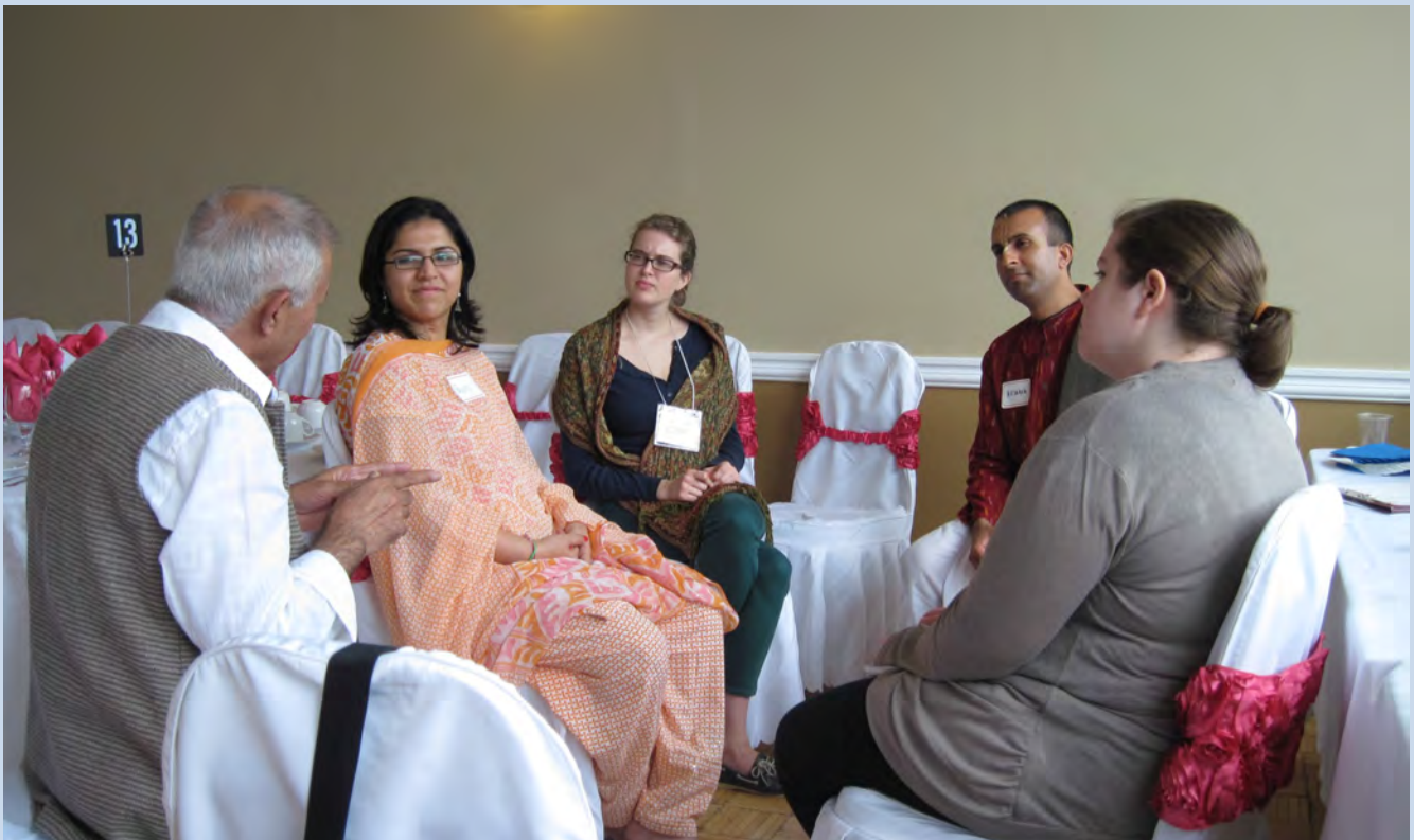
Hindu-Christian Discussion on growing up in each of these faith traditions