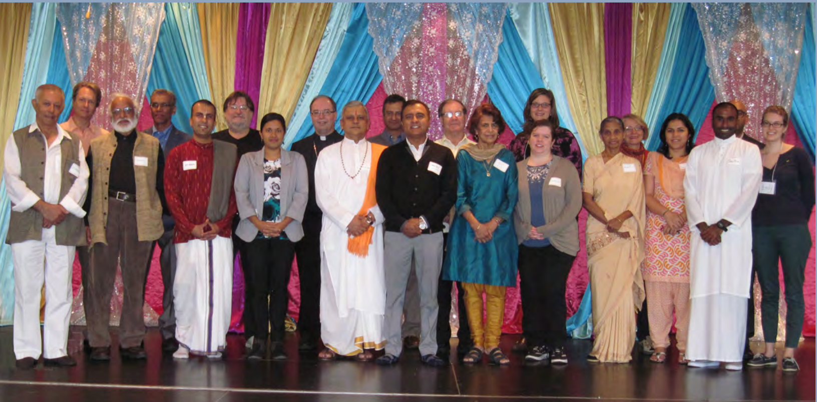
Day of Hindu-Christian Dialogue at Ram Mandir (Hindu Temple) in Mississauga, Canada (October 2014)

“God has so ordered this world that no one can keep his goodness or badness exclusively to himself. The whole world is like the human body with its various members. Pain in one member is felt in the whole body. Rot in one part must inevitably poison the whole system.” (Way to God: The Selected Writings from Mahatma Gandhi, 1971)