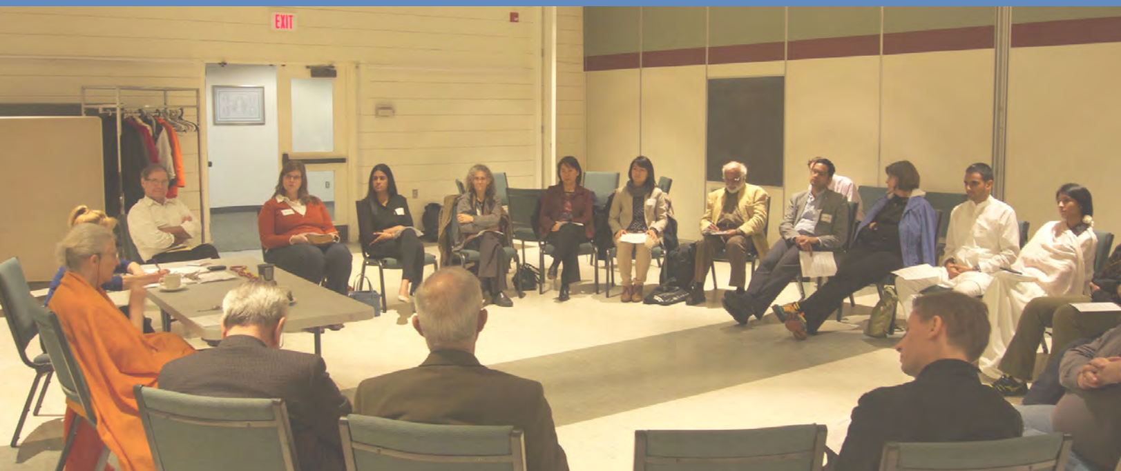
Closing circle discussion of dialogue evening at St. Patrick's Roman Catholic Church