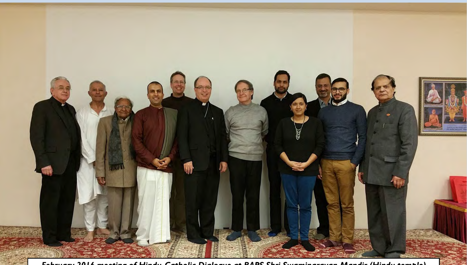
February 2016 meeting of Hindu-Catholic Dialogue at BAPS Shri Swaminarayan Mandir (Hindu temple). Theme: Hindu and Christian theologies of “Incarnation”. This meeting also discussed a public statement of support for refugees that was published in 2016 by the Hindu-Roman Catholic Dialogue of Canada. See text of this statement on previous page.

Associate Professor of Christianity and the Intellectual Tradition, University of Toronto