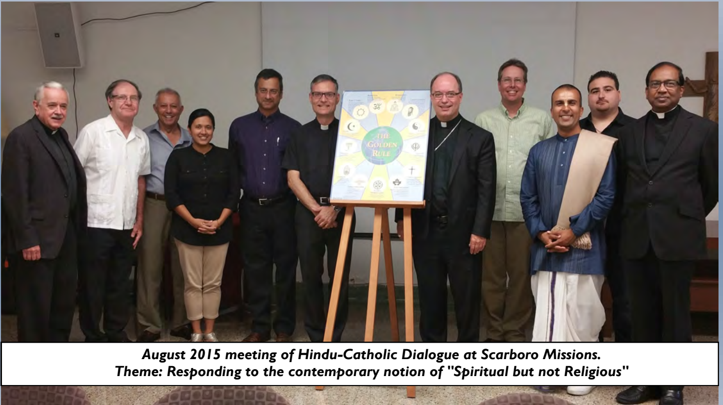
August 2015 meeting of Hindu-Catholic Dialogue at Scarboro Missions. Theme: Responding to the contemporary notion of "Spiritual but not Religious"