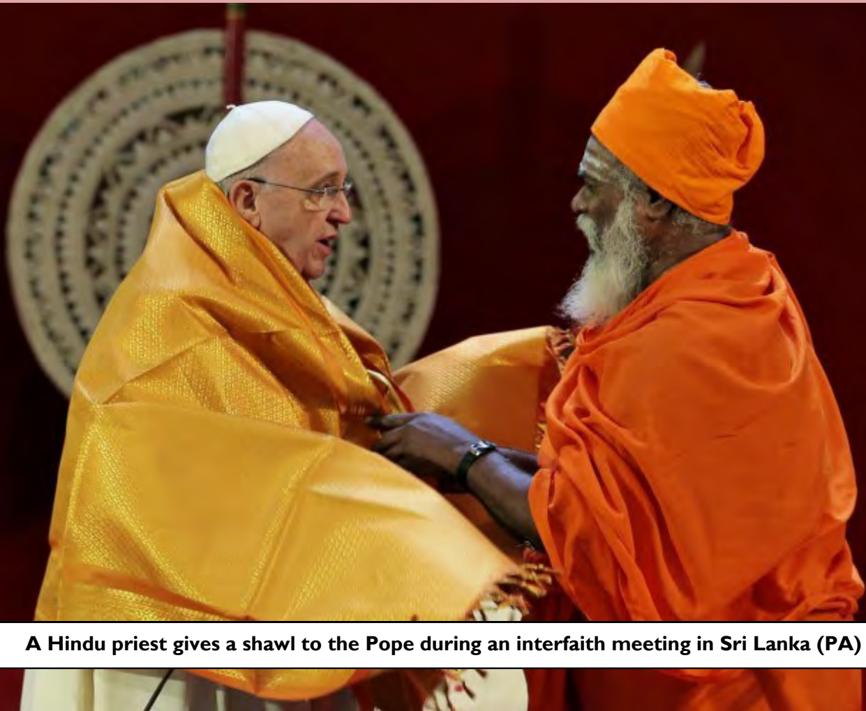
A Hindu priest gives a shawl to the Pope during an interfaith meeting in Sri Lanka