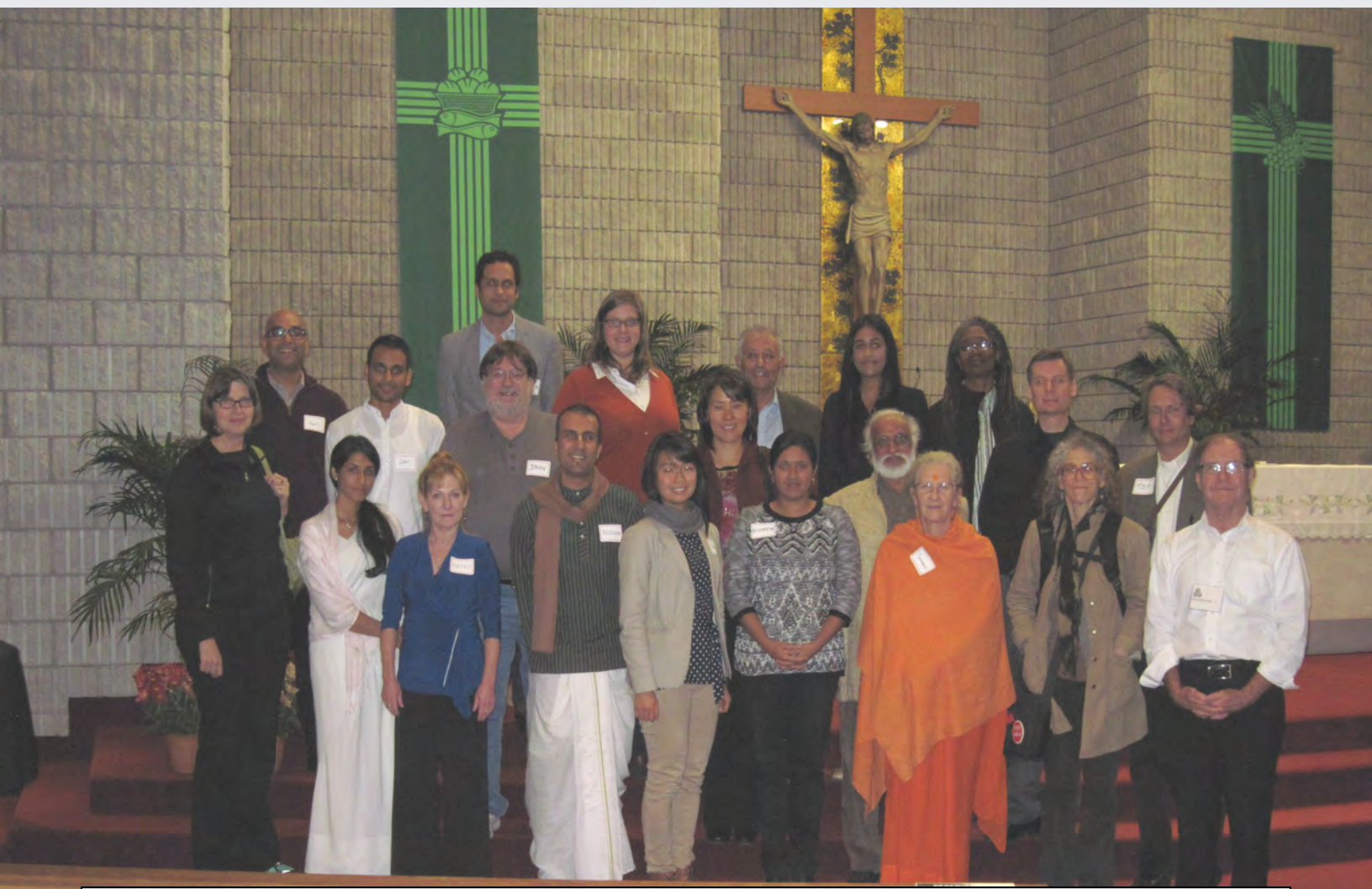
Evening of dialogue for Hindus and Christians in Saint Patrick's Catholic Church in Mississauga, Canada (October 2014)