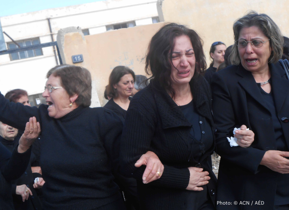
Syria: Destruction in the city of Sadad: Women grieving the victims after atrocities in October 2013.

It is impossible to discuss persecution without considering those who carry it out. In this regard, we can consider three groups: governments (communist or authoritarian); other religious groups (e.g., radical Islam); and ultranationalist movements which demand that their country be of only one religion.