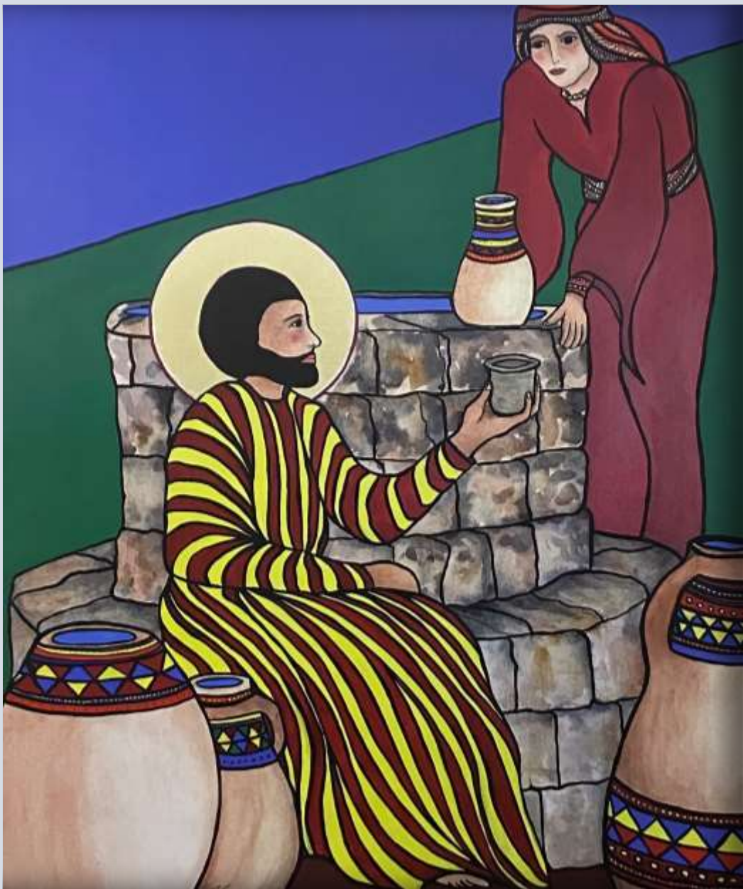
Woman at the Well by Gisele Bauche